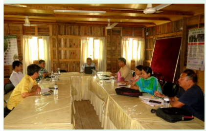
Photo: ED, Taungya is discussing about the completed activities of 1st quarter with the project staff

Staff Coordination Meeting of OLHF Project in March and April 2023