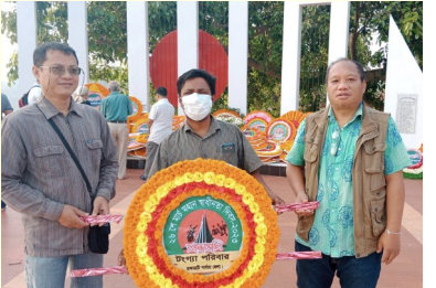
Photo: Taungya Family led by ED offering wreaths at Districts Shahid Miner, Rangamati

Taungya family celebrates 26<sup>th</sup> March 2023, the Independence Day of the People's Republic of Bangladesh by offering wreaths to the martyrs of the great liberation war at District Shahid Miner, Reserve Mukh, Rangamati Hill District along with other NGO staff.