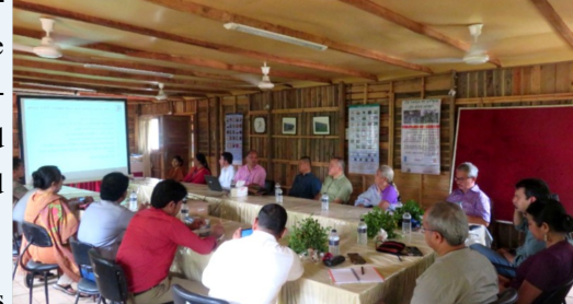
Taungya team and BRAC officials at Ta Conference hall Photo: Meeting between the Tan

Anyway, the school goers and villagers warmly received the visitors and in the non-formal meeting the team dis-