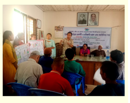
Photo: PC of Taungya OLHF along with Upazila Vice Chairman Barkal and UP member is discussing about MHM in front of community people

order to get their support for the girls' clubs and the girl's priorities on 26 April 2023 at Beleisori upazila and on 27 April 2023 at Barkal upazila. The participants of these meetings were Union Parishad Chairman, Female Upazilla Vice Chairman, Headman, Karbari and Union Parishad member. The member of the Lotibachchora girl's club showcased their poster on