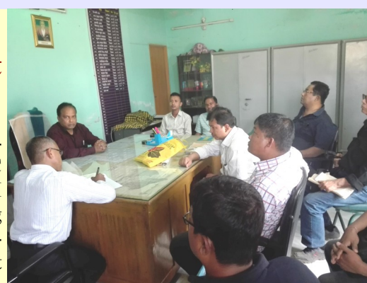
The Meeting was held at Narangiri High School

To address dispute on land ownership a team from Rangamati DC Office visits the Raikhali Part-II sub-project site and sit in a meeting with the concerned affected persons. The meeting was arranged at Narangiri HighSchool adjacent to the sub-project site on 1 March